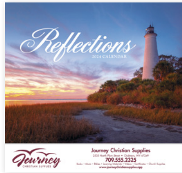
806 Reflections - Stapled (Non-Denominational) as low as $2.25(C) | min. 150