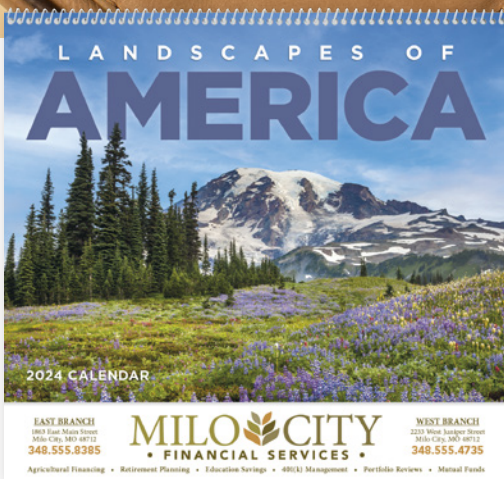
7001 Landscapes of America - Spiral as low as $2.26(C) | min. 150

America's scenic beauty leaps off the pages