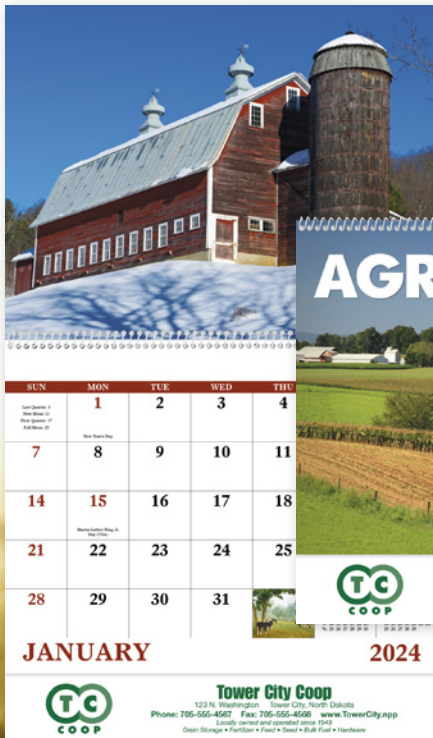
7047 Agriculture - Spiral as low as $2.26(C) | min. 150