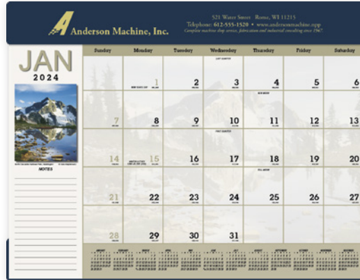
6551 Scenic Desk Pad as low as $16.18(A) | min. 50