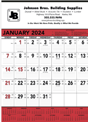
6102 Red & Black Contractor's Memo (13-sheet) as low as $9.72(A) | min. 50

Industry staples at prices you'll love - the best for less