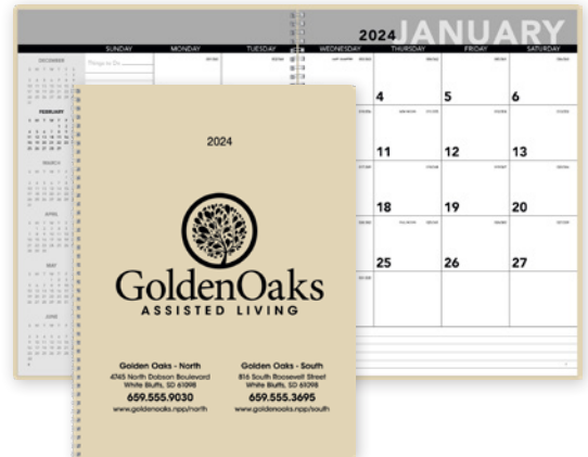
8150 Monthly Planner as low as $8.54(A) | min. 100